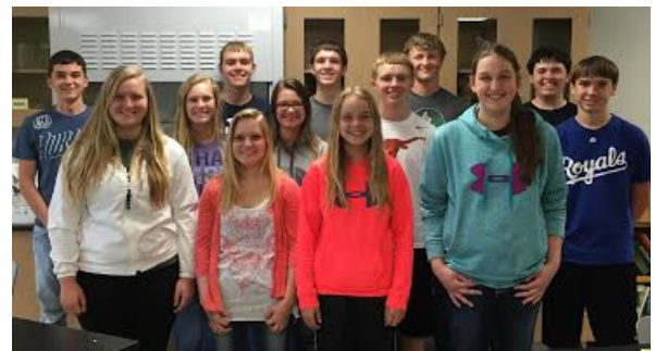
Winners of the Agri-Science Fair. Lewiston FFA sponsored the ribbons.