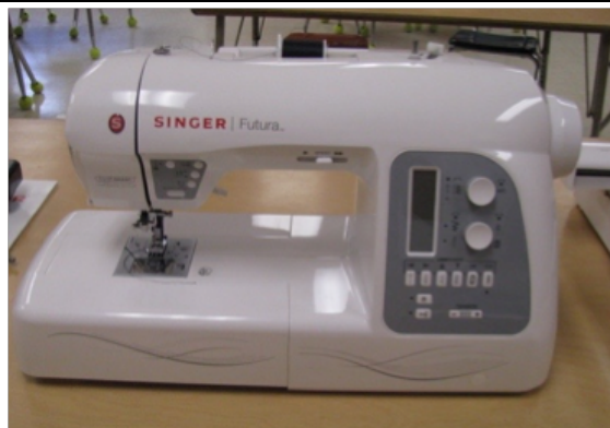
Singer Futura XL-550 Sewing and Embroidery Machine